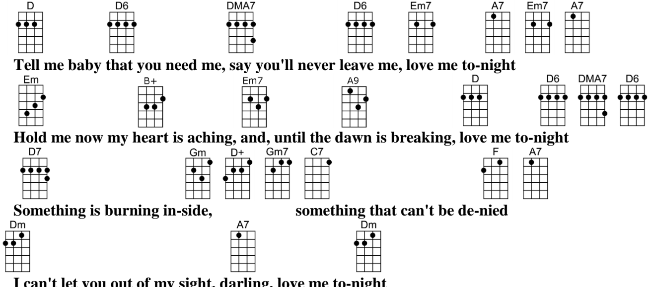
I can't let you out of my sight, darling, love me to-night